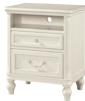
Nightstand 22W x 17D x 27H