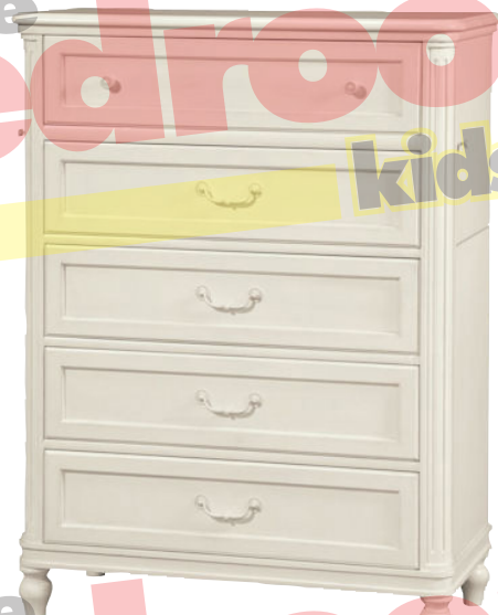
Drawer Chest 39W x 18D x 52H