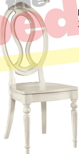
Chair with Storage 17W x 20D x 40H