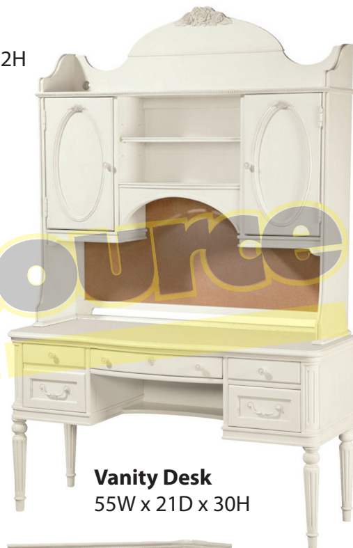
Vanity Desk 55W x 21D x 30H