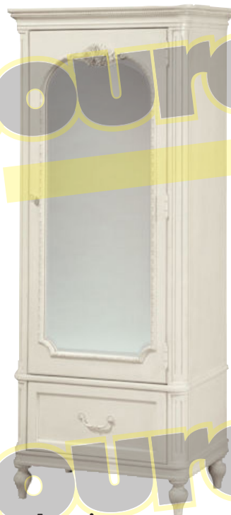
Armoire 29W x 19D x 71H