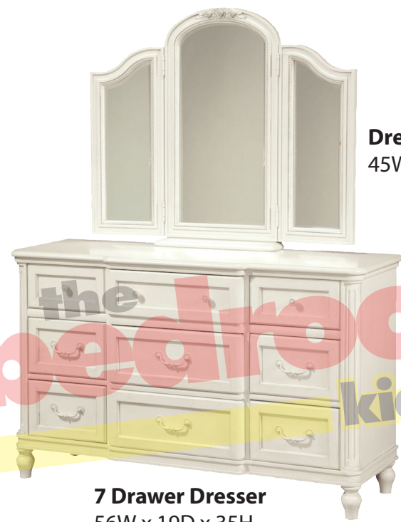
7 Drawer Dresser 56W x 19D x 35H