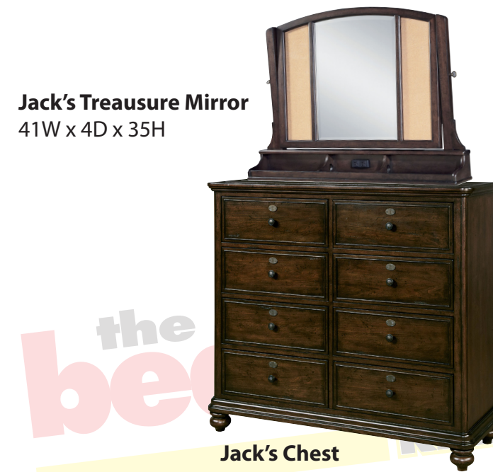
Jack's Treasure Mirror 41W x 4D x 35H