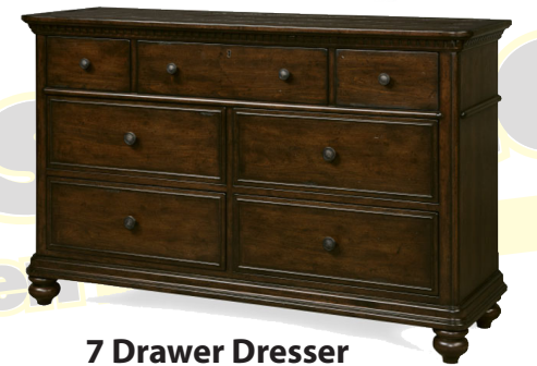
7 Drawer Dresser