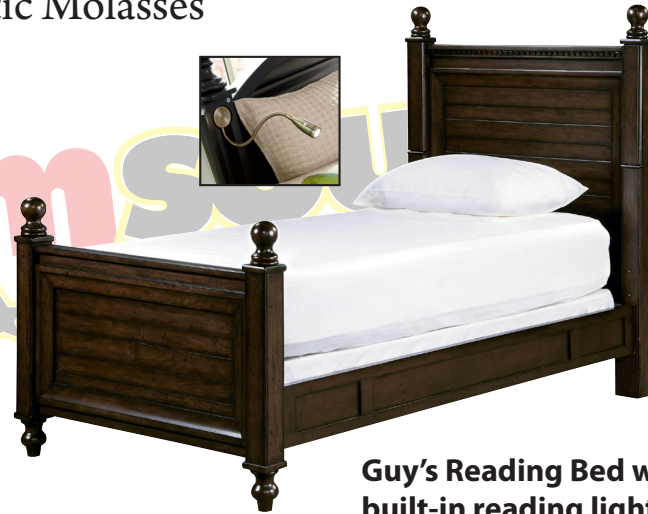
Guy's Reading Bed with built-in reading light

Twin - 44W x 80D x 51H Full - 59W x 80D x 51H