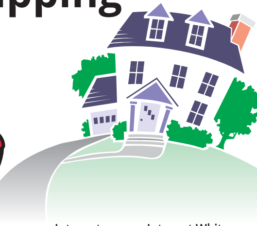
Internet Free Shipping