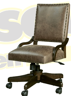
Swivel Desk Chair