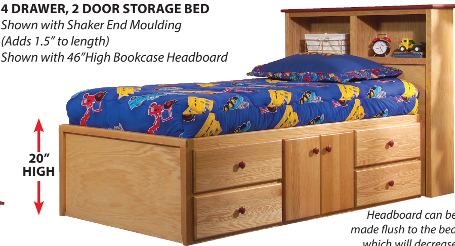
4 DRAWER, 2 DOOR STORAGE BED Shown with Shaker End Moulding (Adds 1.5" to length) Shown with 46"High Bookcase Headboard

Headboard can be made flush to the bed which will decrease width 2" on each side