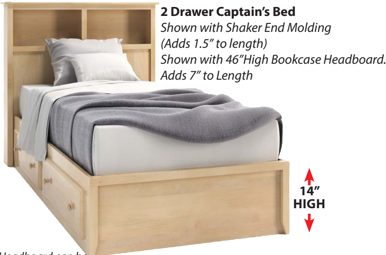
2 Drawer Captain's Bed Shown with Shaker End Molding (Adds 1.5" to length) Shown with 46"High Bookcase Headboard. Adds 7" to Length