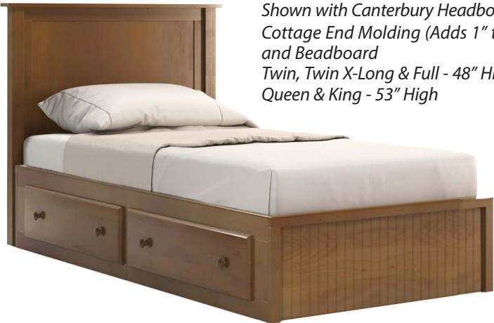
2 Drawer Captain's Bed Shown with Canterbury Headboard and Cottage End Molding (Adds 1" to length) and Beadboard Twin, Twin X-Long & Full - 48" High Queen & King - 53" High

Headboard can be made flush to the bed which will decrease width 2" on each side