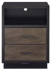
Nightstand 21W x 18D x 28H