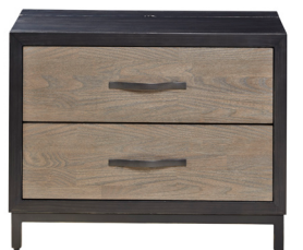
2 Drawer Nightstand 27W x 18D x 21H