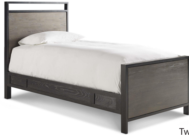
Panel Bed Twin - 41W x 82L x 50H Full - 56W x 82L x 50H