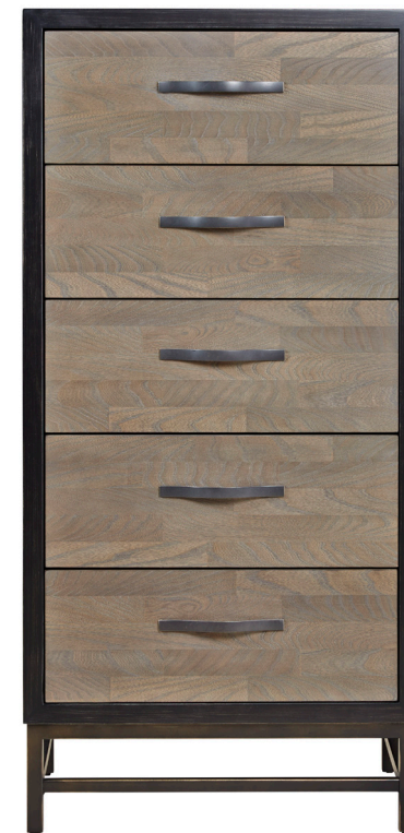
Narrow Chest 24W x 18D x 50H