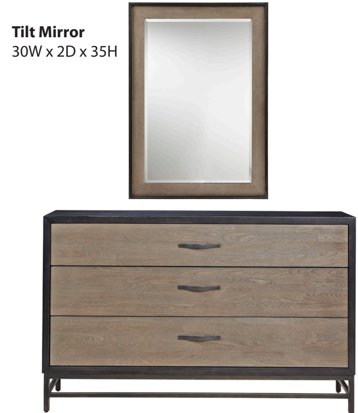
3 Drawer Dresser 56W x 18D x 34H