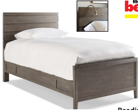
Reading Bed with built-in LED light Twin - 43W x 80L x 47H Full - 58W x 80L x 47H