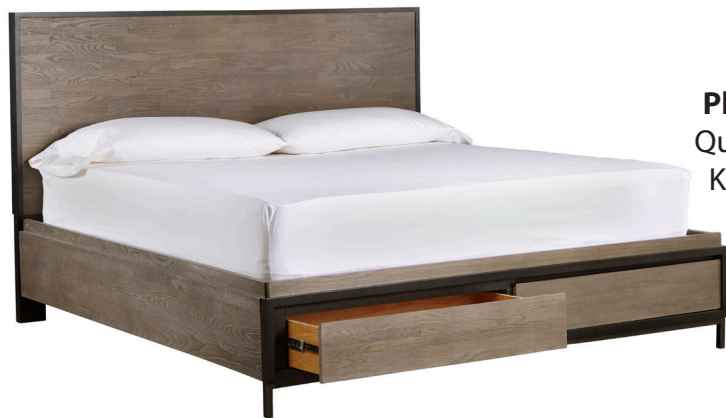
Platform Storage Bed Queen: 66W x 86L x 52H King: 82W x 86L x 52H