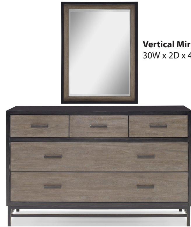
5 Drawer Dresser 54W x 18D x 34H