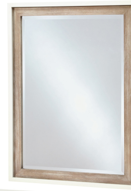
Vertical Mirror 30W x 2D x 40H