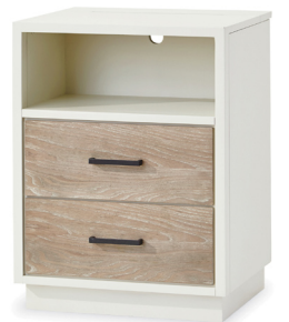
Nightstand 21W x 18D x 28H