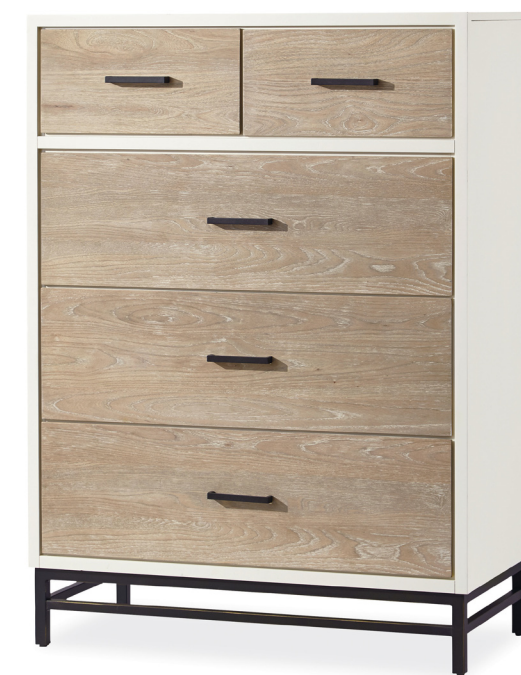
2 over 3 Drawer Chest 36W x 18D x 50H