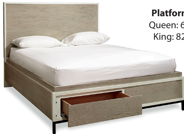
Platform Storage Bed Queen: 66W x 86L x 52H King: 82W x 86L x 52H