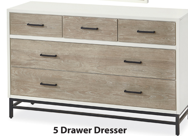
5 Drawer Dresser 54W x 18D x 34H