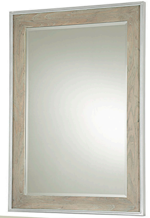
Vertical Mirror 32W x 2D x 45H