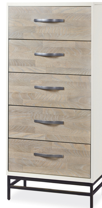
Narrow Chest 24W x 18D x 50H