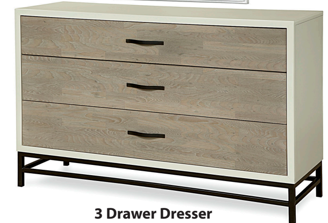
3 Drawer Dresser 56W x 18D x 34H