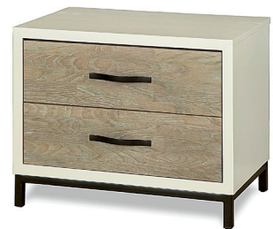
2 Drawer Nightstand 27W x 18D x 21H