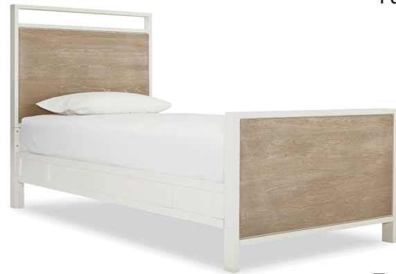
Panel Bed Twin - 41W x 82L x 50H Full - 56W x 82L x 50H