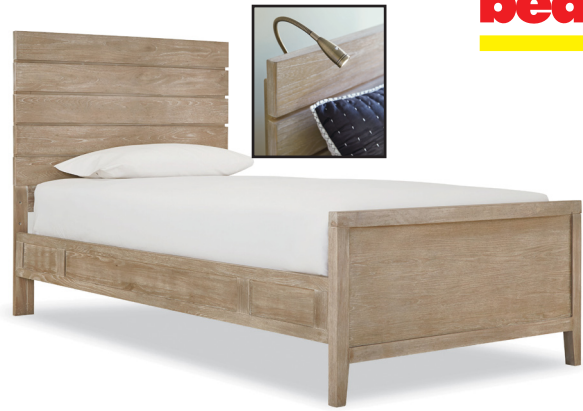
Reading Bed with built-in LED light Twin - 43W x 80L x 47H Full - 58W x 80L x 47H