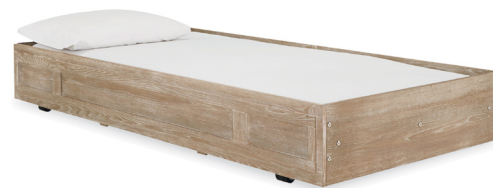
Trundle For Mattress or Storage 41W x 76L x 12H