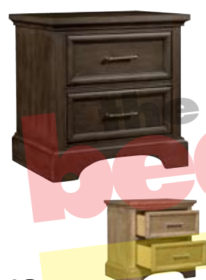
2 Drawer Nightstand 25W x 18D x 25H