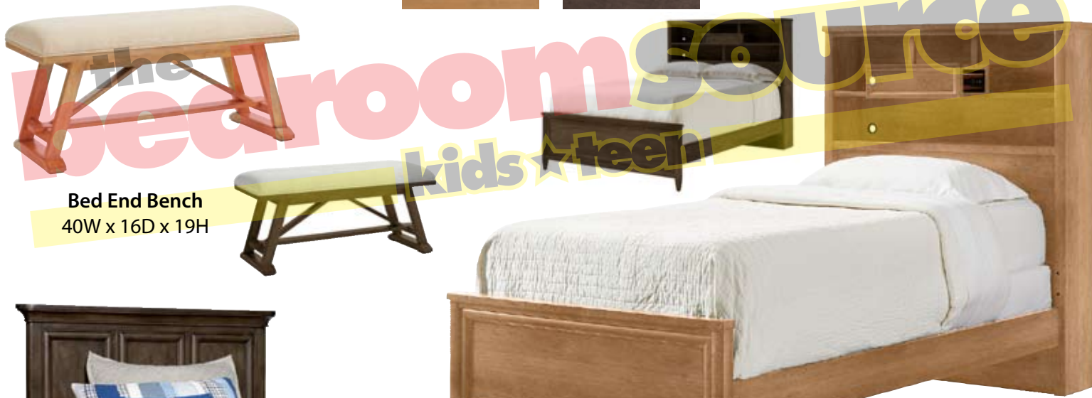
Bookcase Bed Twin: 42W x 89D x 54H Full: 57W x 89D x 54H