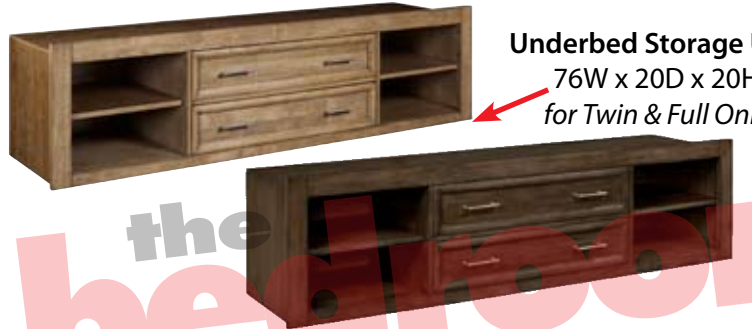
Underbed Storage Unit 76W x 20D x 20H for Twin & Full Only