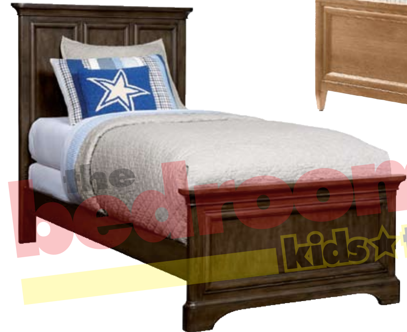
Panel Bed Twin: 46W x 81D x 54 1/2H Full: 58.4"W x 81D x 54 1/2H Queen: 69W x 87D x 60H