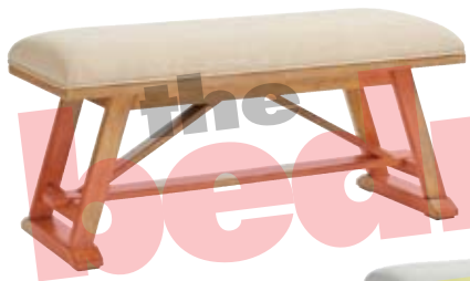
Bed End Bench 40W x 16D x 19H