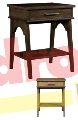
1 Drawer Open Nightstand 20W x 18D x 26H