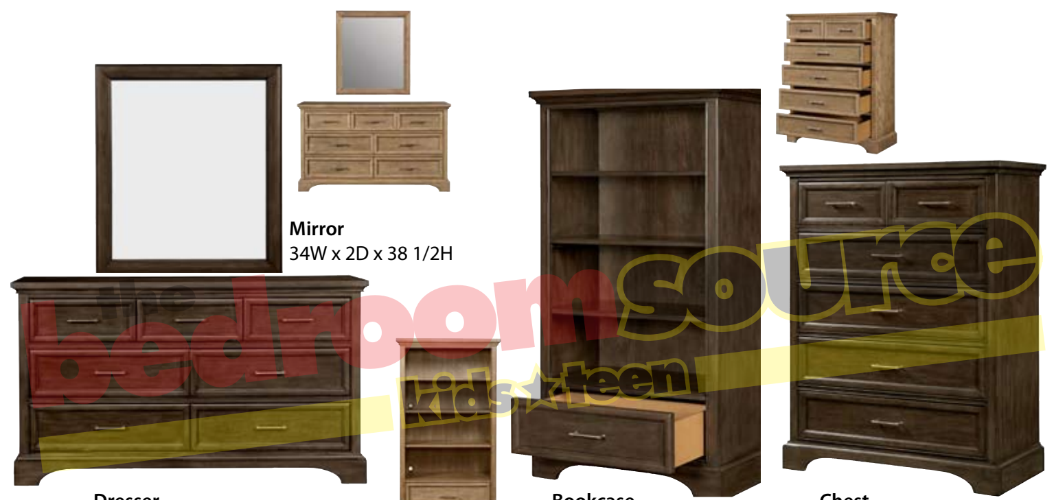
Mirror 34W x 2D x 38 1/2H