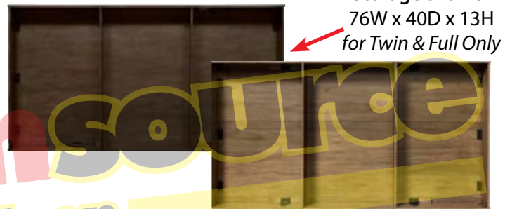
Trundle / Storage Drawer 76W x 40D x 13H for Twin & Full Only