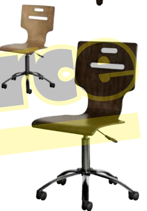
Desk Chair with Wheels & Wood Seat 17W x 20D x 36H