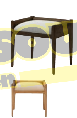
Upholstered Stool 21W x 17D x 20H