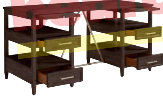
Double Pedestal Desk 60W x 26D x 30H