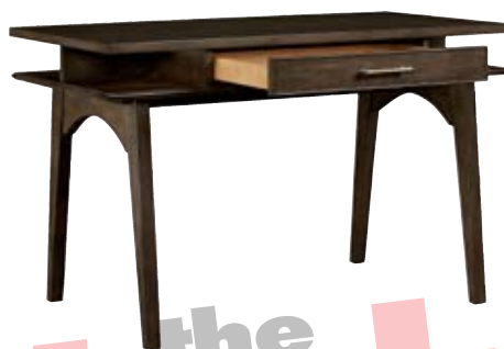
1 Drawer Desk 48W x 26D x 30H