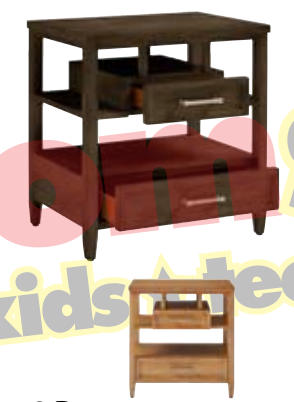
2 Drawer Open Nightstand 25W x 18D x 26H