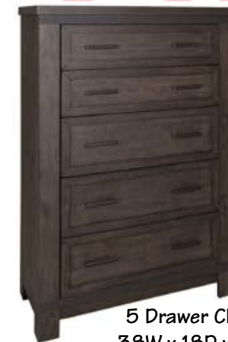
5 Drawer Chest 38W x 18D x 54H