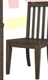
Student Chair 19W x 20D x 36H