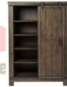
Sliding Door Chest 44W x 18D x 61H