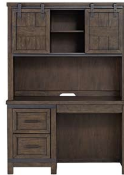
Farmhouse Hutch 50W x 14D x 40H