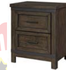
Night Stand 24W x 17D x 28H