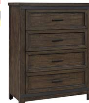
4 Drawer Chest 38W x 18D x 48H