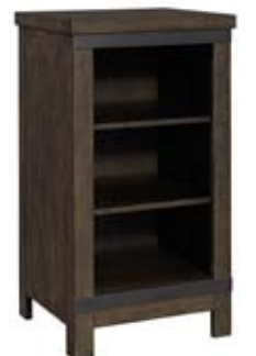
Low Loft Bookcase 20W x 17D x 35H