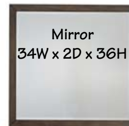
Mirror 34W x 2D x 36H