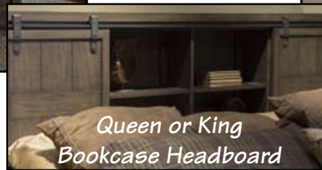
Queen or King Bookcase Headboard