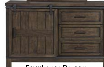
Farmhouse Dresser 56W x 19D x 35H