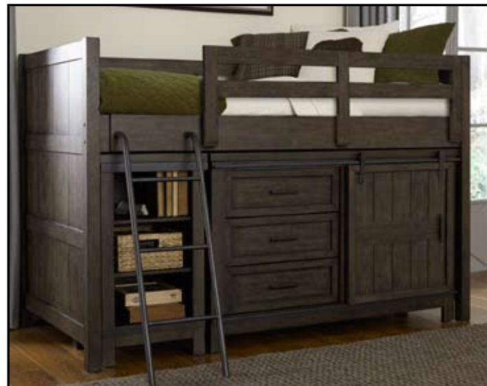
Low Loft with Dresser & Bookcase 43W x 80L x 54H