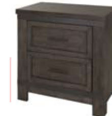
Wide Night Stand 28W x 17D x 28H