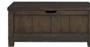
Toy Chest Bench 36W x 18D x 17H