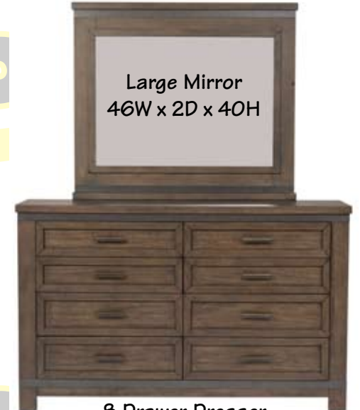
8 Drawer Dresser 64W x 18D x 40H