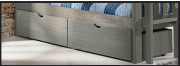
Two Large Storage Drawers