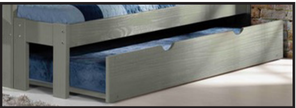
Slatted Trundle Bed (Twin Size)

Shown with Underbed Drawers Sold Separately