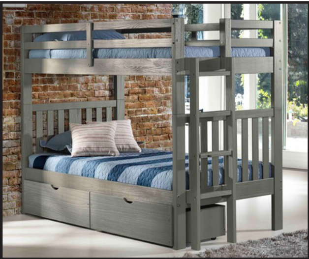
Ladder adds 4 inches

Staircase can go on the right or left side