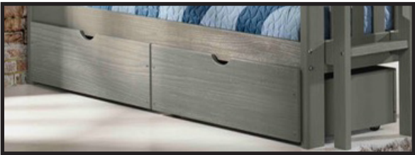
Two Large Storage Drawers