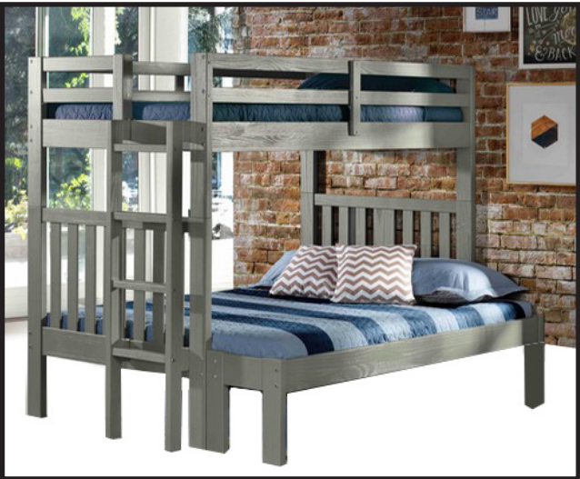
Ladder adds 4 inches

Twin / Twin 78W x 42D x 66H Twin / Full 78W x 57D x 66H