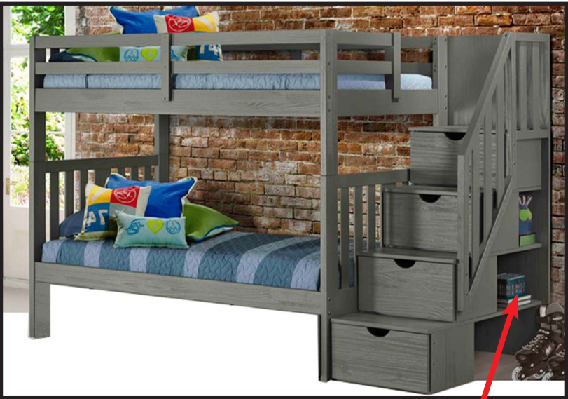
Added Storage on the Side

Staircase can go on the right or left side