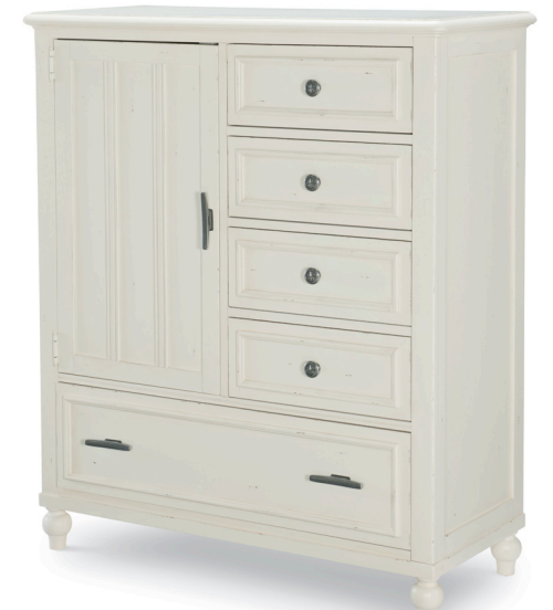
Door Chest 42W x 18D x 50H