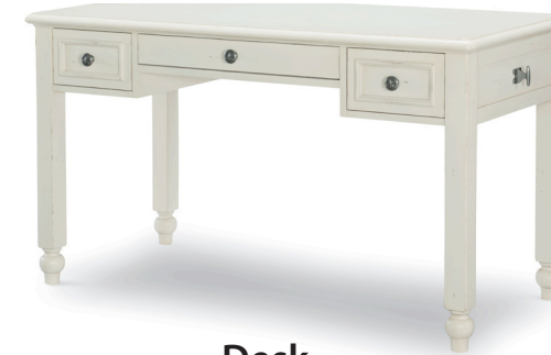
Desk 53W x 24D x 30H