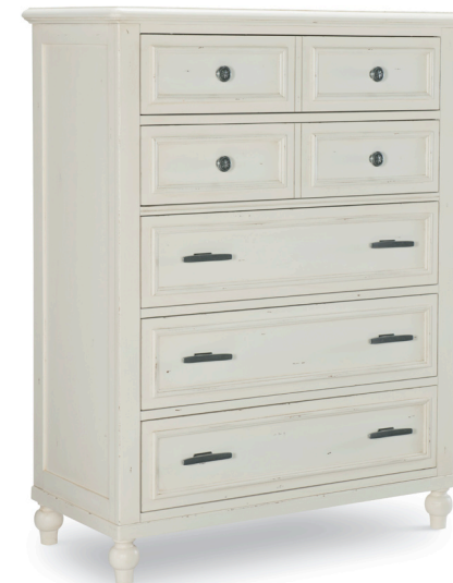
5 Drawer Chest 38W x 18D x 50H