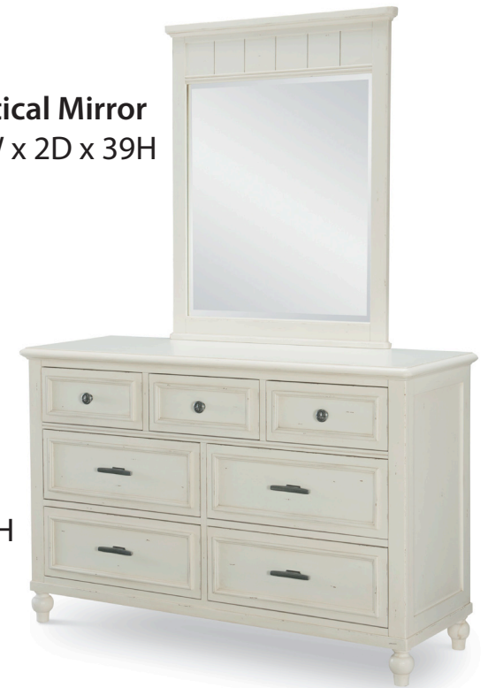
Vertical Mirror 31W x 2D x 39H