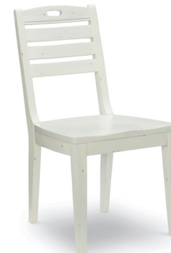
Desk Chair 19W x 21D x 34H