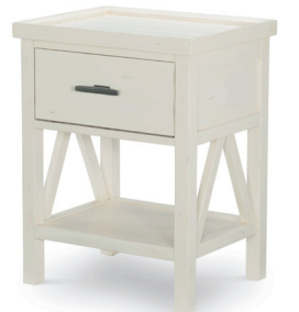
Night Stand 20W x 16D x 28H