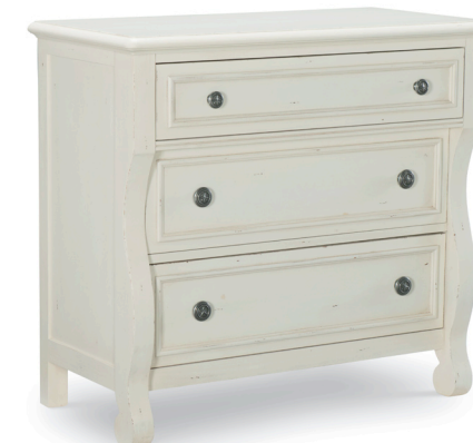
3 Drawer Chest 37W x 18D x 34H