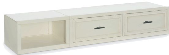
Underbed Storage Unit 76W x 18D x 13H

Twin over Twin: 80W x 67D x 70H Twin over Full: 80W x 67D x 70H