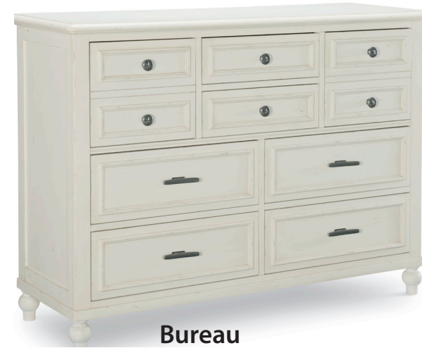
Bureau 53W x 18D x 40H