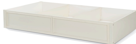
Trundle Storage Drawer 75W x 42D x 13H