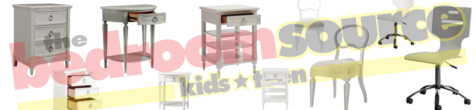
3 Drawer Nightstand 22 1/2W x 18D x 29 1/2H