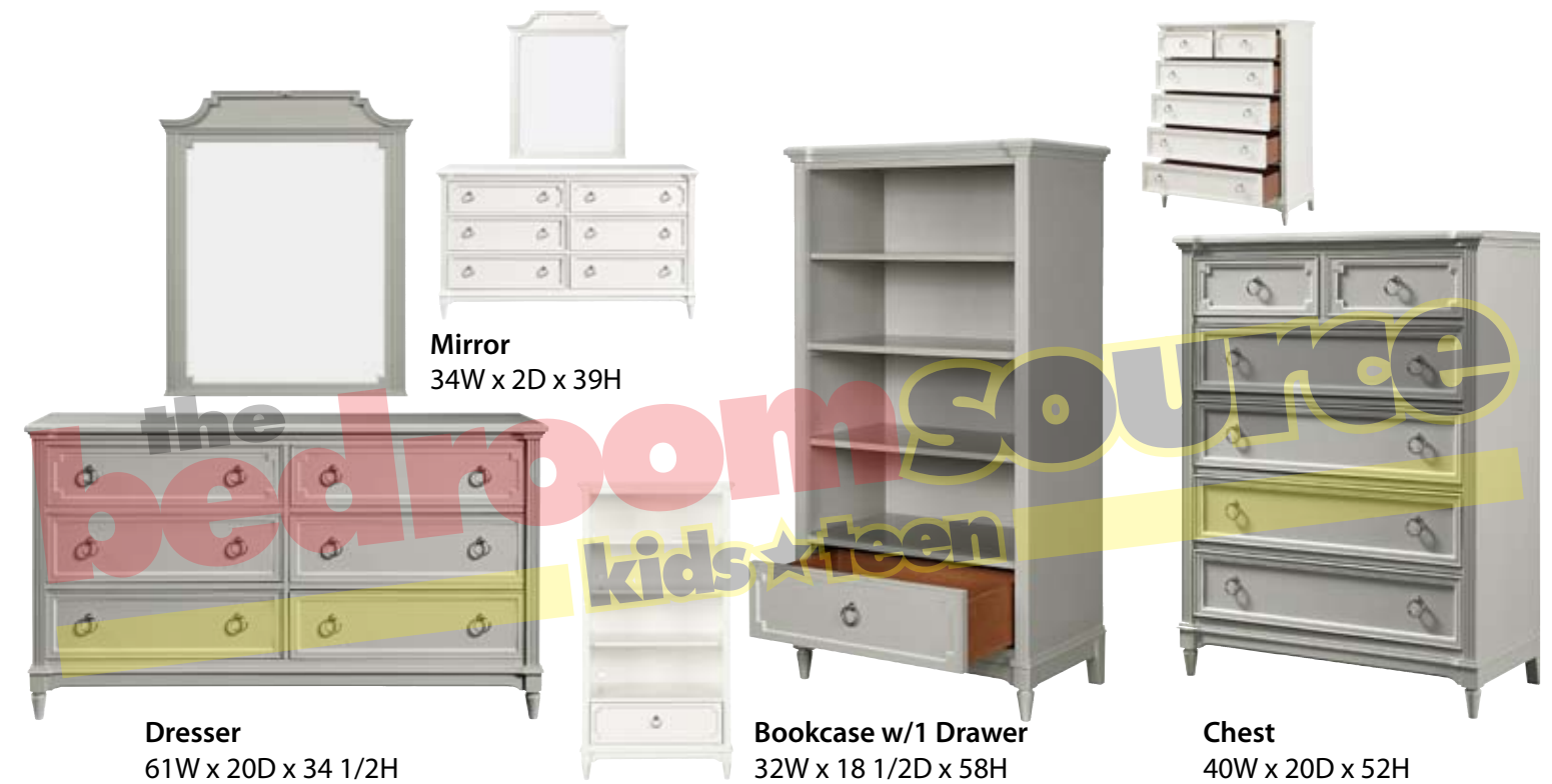
Mirror 34W x 2D x 39H