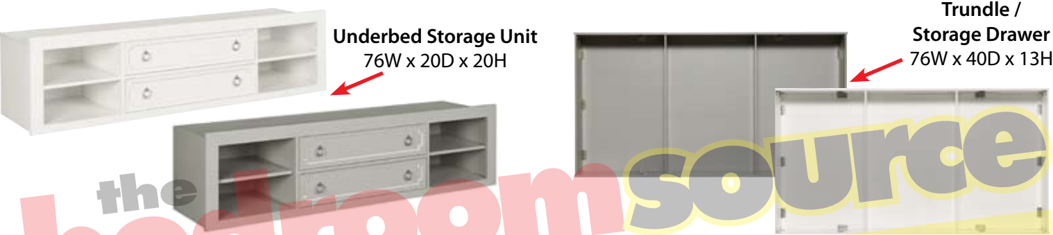
Underbed Storage Unit 76W x 20D x 20H