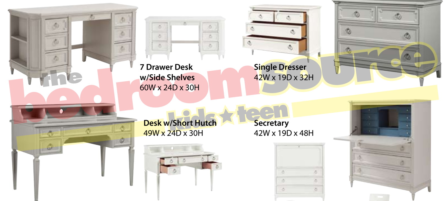
7 Drawer Desk w/Side Shelves 60W x 24D x 30H