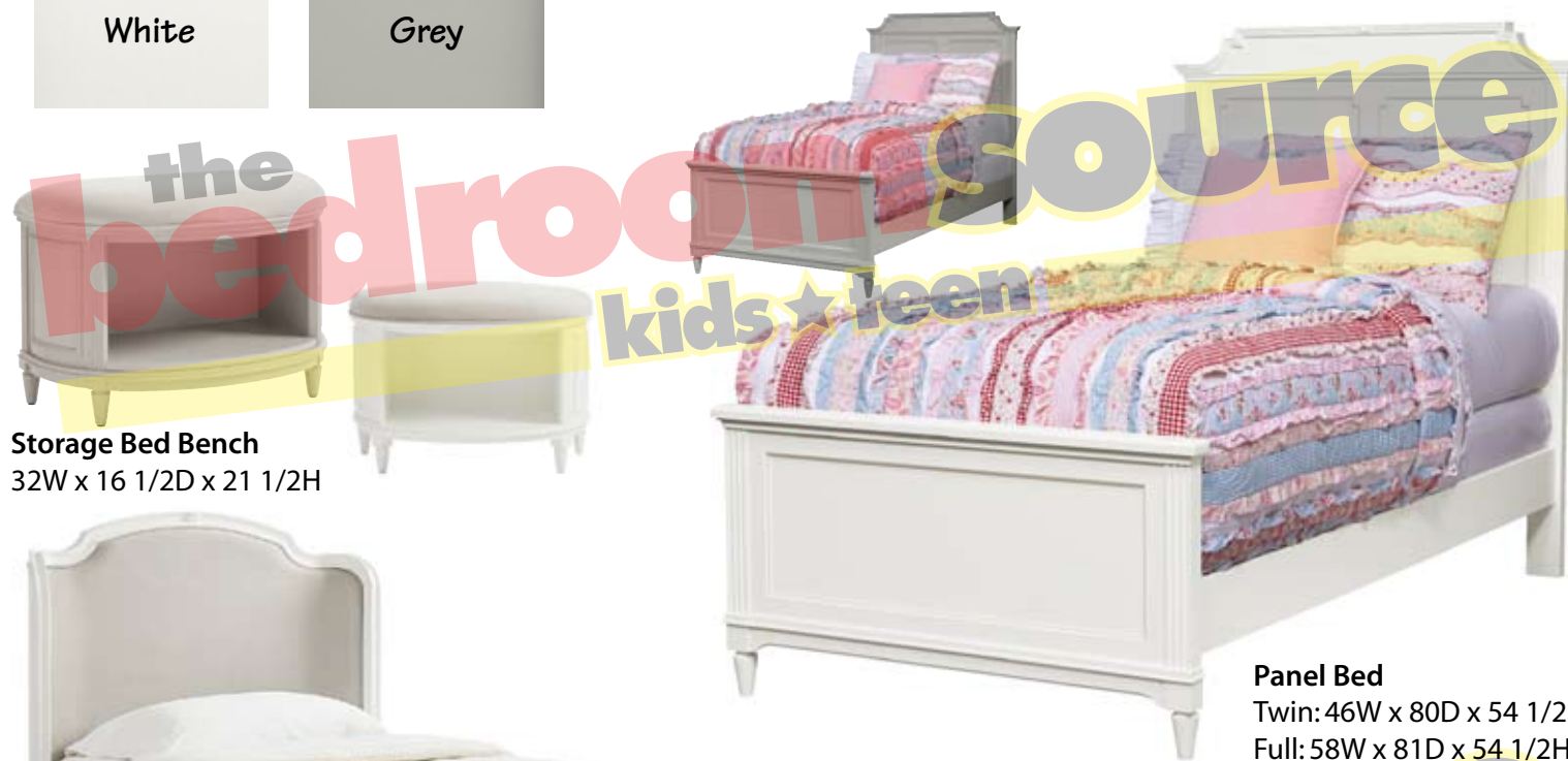
Storage Bed Bench 32W x 16 1/2D x 21 1/2H