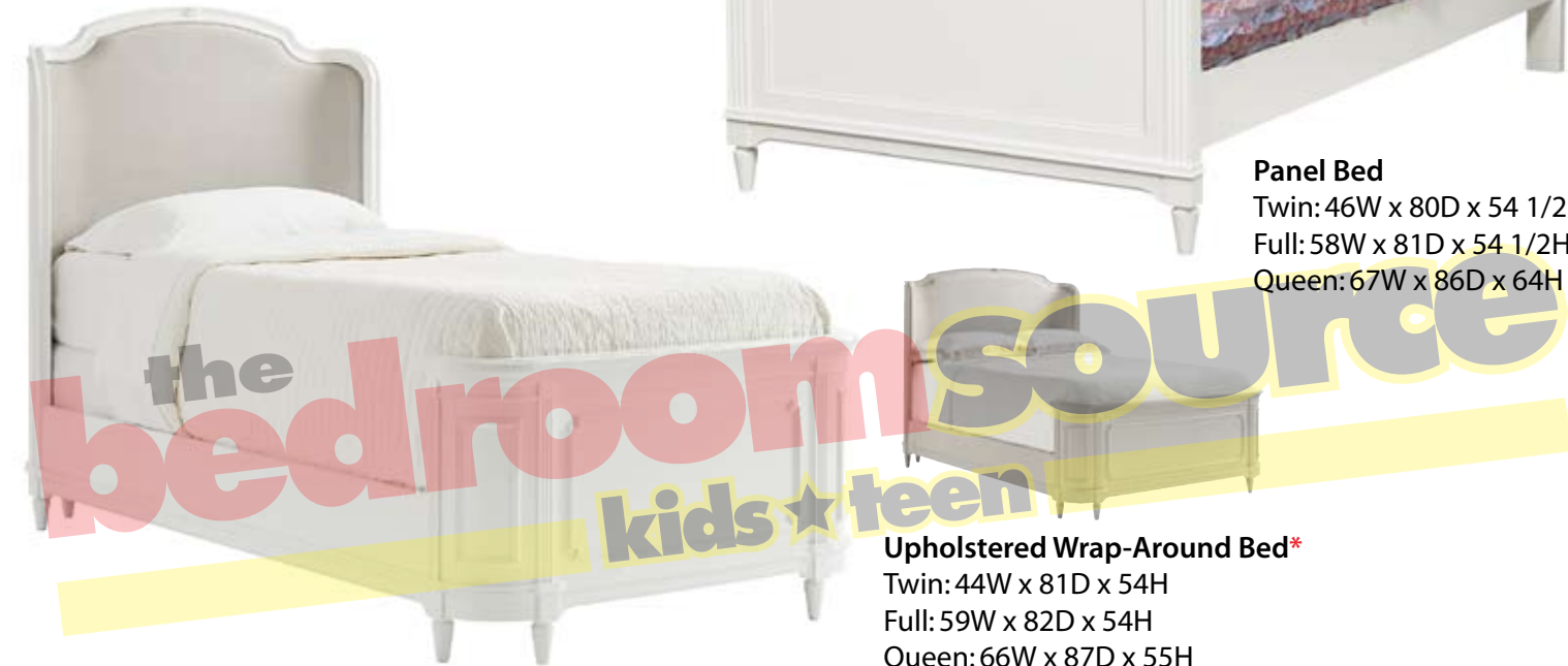
Panel Bed Twin: 46W x 80D x 54 1/2H Full: 58W x 81D x 54 1/2H Queen: 67W x 86D x 64H