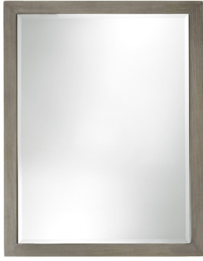
Vertical Mirror 30W x 2D x 40H