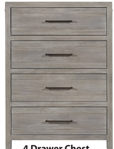
4 Drawer Chest 36W x 18D x 52H