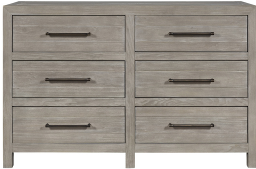
6 Drawer Dresser 54W x 18D x 35H