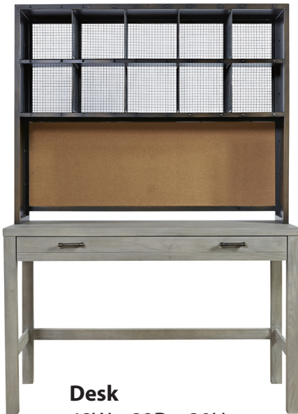
Desk 48W x 22D x 30H