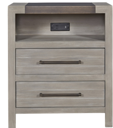
Metal Nightstand 24W x 16D x 28H