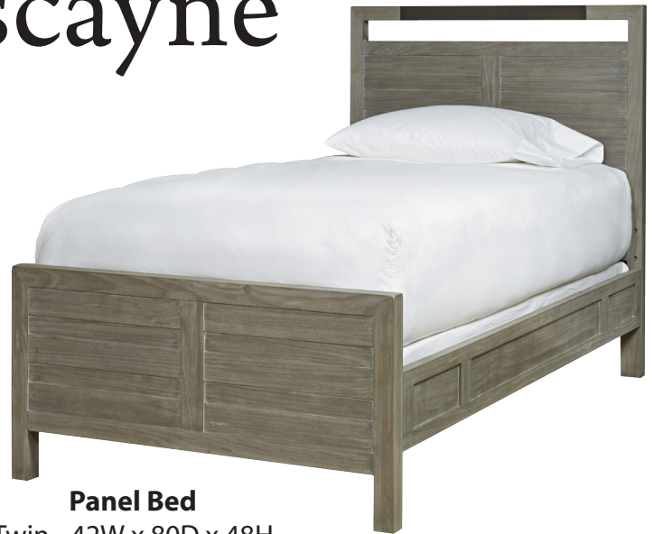
Panel Bed Twin - 42W x 80D x 48H Full - 57W x 80D x 48H