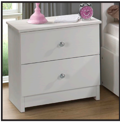
Night Stand (2 Drawers) 22"W x 17"D x 22"H