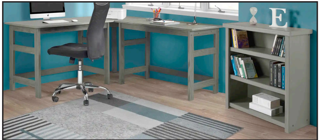
3 Piece Corner Desk 67"W x 67"D x 30"H (Available in Gray Brushed Finish) Add Corner Connector to create "L" Desk Configuration