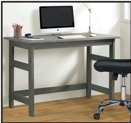
Single Desk 44"W x 23"D x 30"H (Available in Gray Brushed Finish)