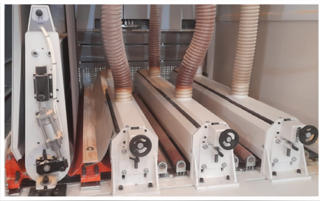
Wood passes through a series of wire brushing wheels.