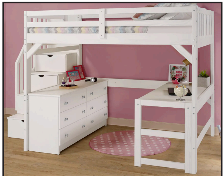
Full Loft with Desk & Staircase 101" W x 58 1/2" D x 72 1/2" H Shown with Optional 6 Drawer Dresser

Chair Pictured Not Available. Other Chairs in Many Colors Available