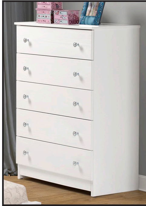
5 Drawer Chest 33"W x 17"D x 45"H