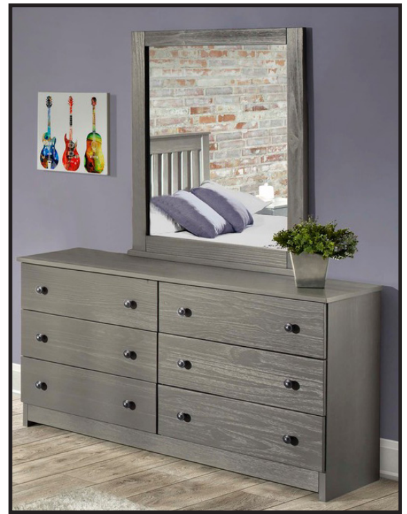
Mirror 6 Drawer Dresser 32"W x 2"D x 39"H 55"W x 17"D x 30"H