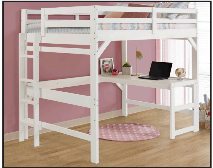
Full Loft with Desk & Ladder 82" W x 58 1/2" D x 72 1/2" H