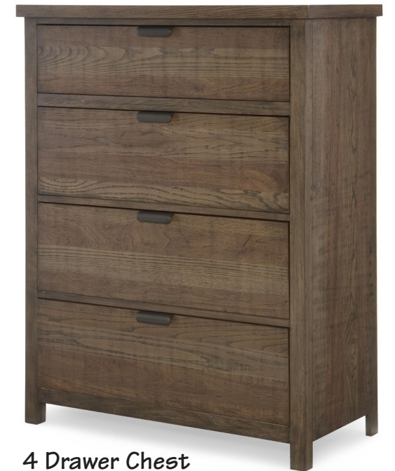
4 Drawer Chest 38W x 18D x 50H