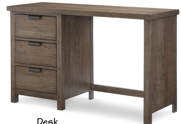
Desk 50W x 18D x 30H