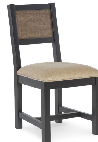
Desk Chair 19W x 21D x 34H