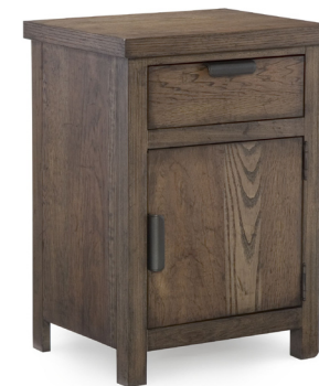
Nightstand 20W x 16D x 28H