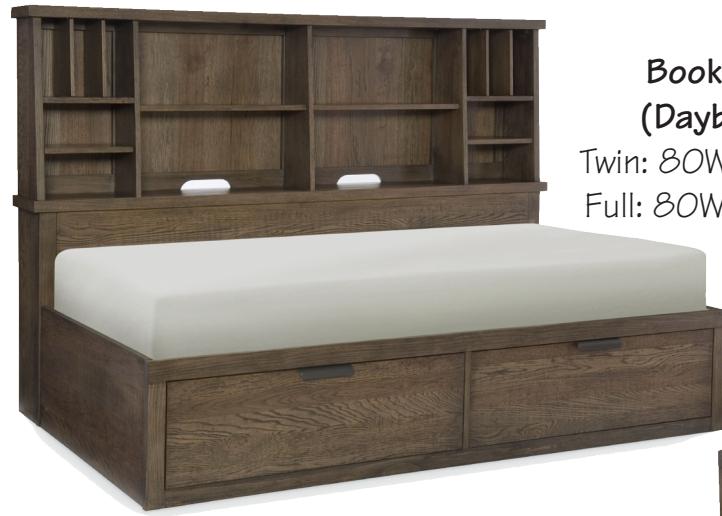
Bookcase Bed (Daybed Style)

Twin: 80W x 50D x 54H Full: 80W x 65D x 54H