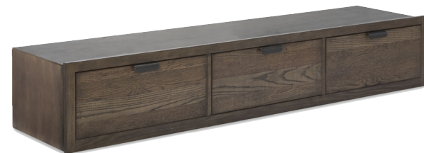
Underbed Storage Drawer