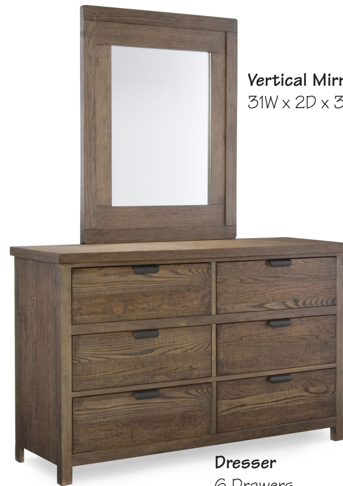
Vertical Mirror 31W x 2D x 39H