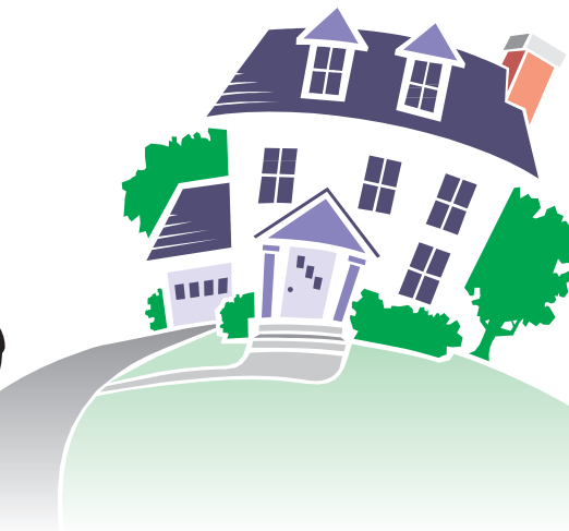
bedroomsource Platinum Delivery