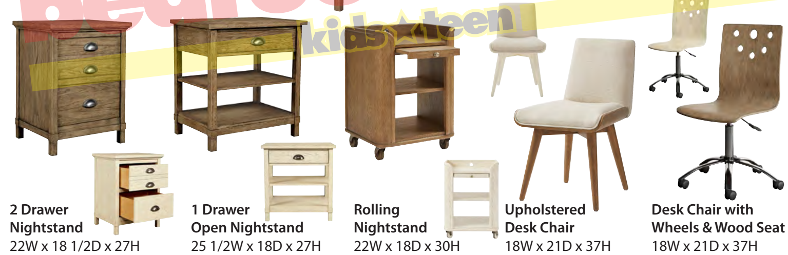
2 Drawer Nightstand 22W x 18 1/2D x 27H