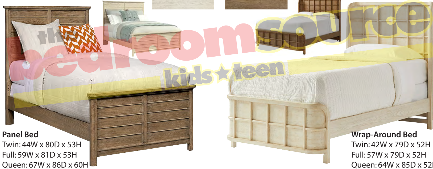
Panel Bed Twin: 44W x 80D x 53H Full: 59W x 81D x 53H Queen: 67W x 86D x 60H