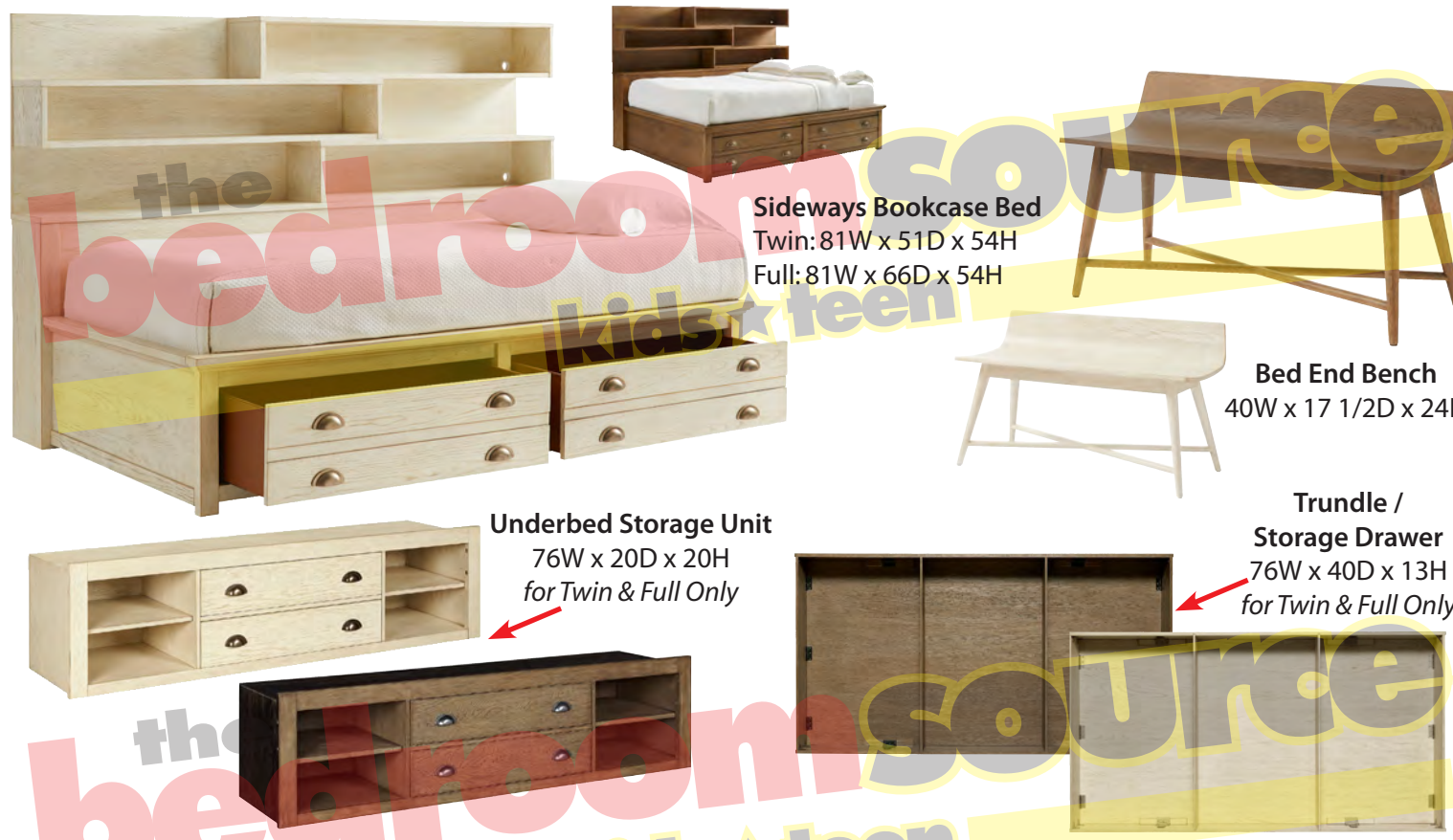
Sideways Bookcase Bed Twin: 81W x 51D x 54H Full: 81W x 66D x 54H