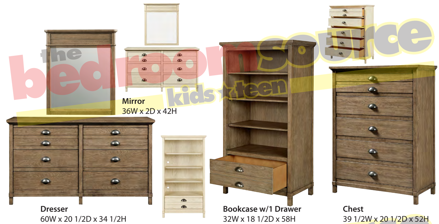
Mirror 36W x 2D x 42H