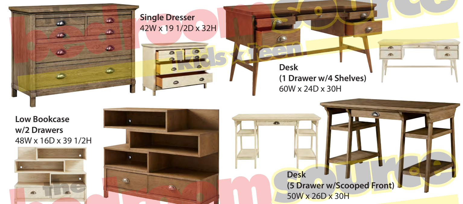
Single Dresser 42W x 19 1/2D x 32H